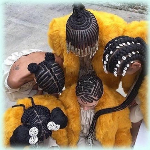
Creative expressions of natural hair